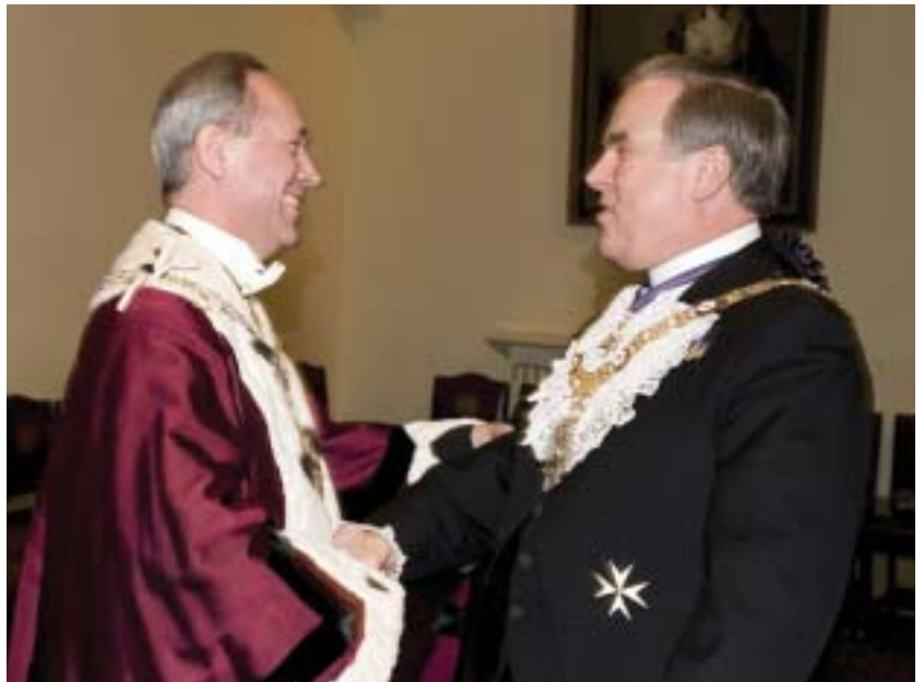
The Master greets The Lord Mayor