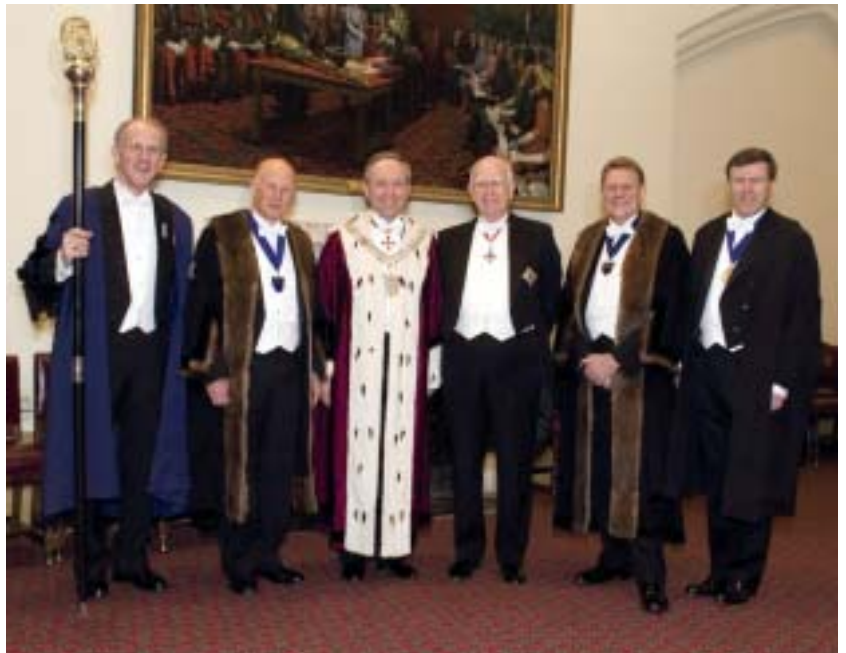
The Beadle, Senior Warden, The Master, Guest Speaker Sir Robert Worcester, Junior Warden, Clerk