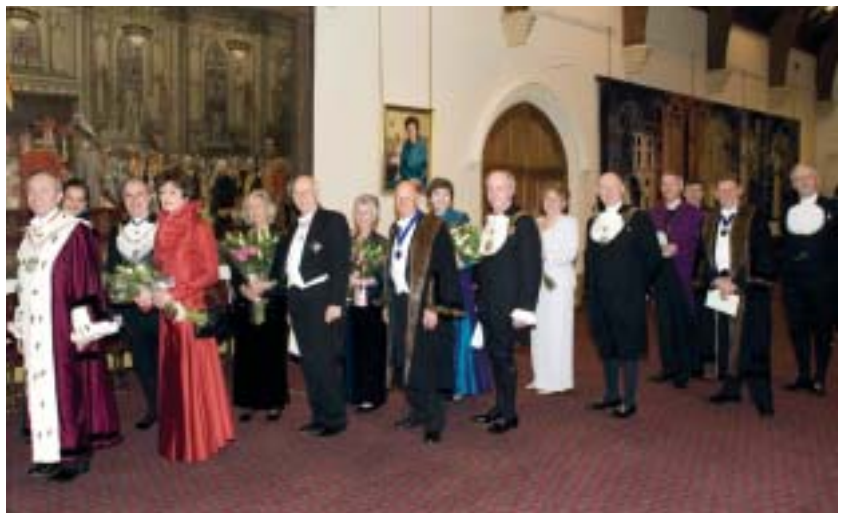
The Masters Procession